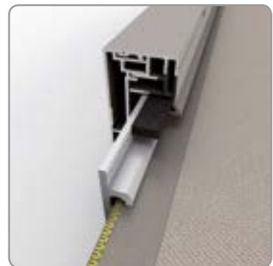
Detail of the side channel