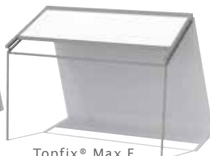
Topfix® Max F