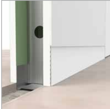
Thin adhesive skirting board (type 1)