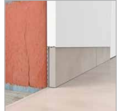
Recessed skirting board (type 2) with finishing skirting board in the same material as the floor